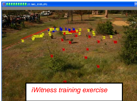
iWitness training exercise

Thirty-one of sixty CAL FIRE law enforcement investigators were trained the week of April 2 nd , 2007, at the CDF facility in Redding, CA. The remaining twenty-nine investigators are scheduled for training of the photogrammetry technology the week of April 16 th , 2007 at the CAL FIRE facility in Fresno, CA. CAL FIRE had also purchased a quantity of sixty Canon Digital Rebel XTi cameras for their scene investigations.